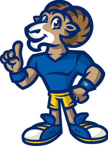
HOLDING UP INDEX FINGER